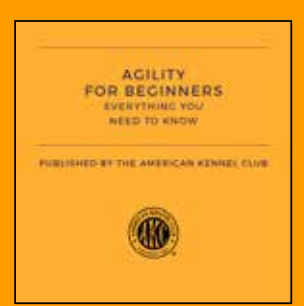
AGILITY FOR BEGINNERS