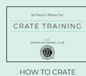
TRAIN YOUR DOG