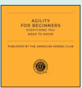
AGILITY FOR BEGINNERS