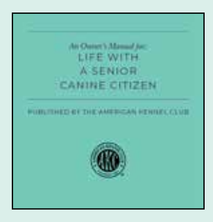
LIFE WITH A SENIOR DOG