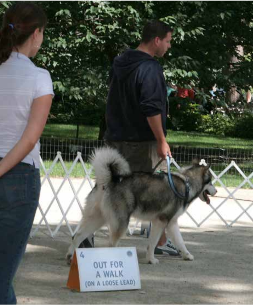
Mary Bloom ©AKC

This test demonstrates that the handler is in control of the dog. The dog may be on either side of the handler. The dog's position should leave no doubt that the dog is attentive to the handler and is responding to the handler's movements and changes of direction. The dog need not be perfectly aligned with the handler and need not sit when the handler stops. The evaluator may use a pre-plotted course or may direct the handler/dog team by issuing instructions or commands. In either case, there should be a right turn, left turn, and an about turn with at least one stop in between and another at the end. The handler may talk to the dog along the way, praise the dog, or give commands in a normal tone of voice. The handler may sit the dog at the halts if desired.