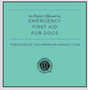
FIRST AID FOR DOGS