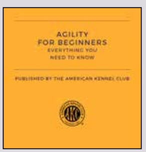
AGILITY FOR BEGINNERS