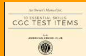
CANINE GOOD CITIZEN