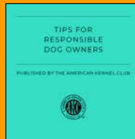
RESPONSIBLE DOG OWNER TIPS