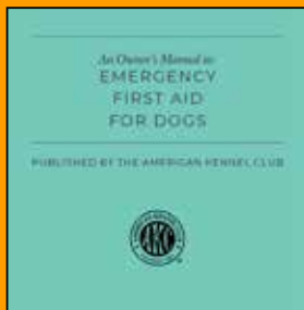
FIRST AID FOR DOGS