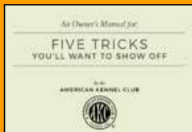
5 TRICKS TO SHOW OFF

We hope this information was valuable to you in helping your puppy live a long, healthy, happy life. Below, find additional books in our Owner's Manual series designed to strengthen the bond between you and your furry family member.