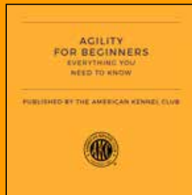
AGILITY FOR BEGINNERS