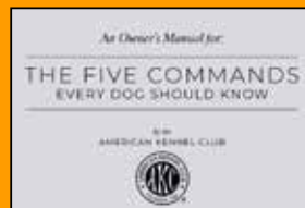
5 BASIC COMMANDS