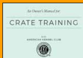
HOW TO CRATE TRAIN YOUR DOG