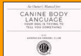
CANINE BODY LANGUAGE