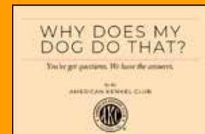
WHY DOES MY DOG DO THAT?