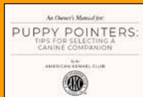
SELECTING A PUPPY