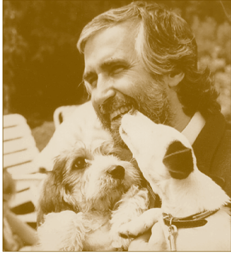
Puppy cuddle time.

Many adult dogs are more fearful of men than they are of women. So invite over as many men as possible to handle and gentle your puppy. It is especially important to invite men to socialize with your puppy if no men are living in the household. Make sure you teach all male visitors how to handfeed kibble to lure/reward your pup to come, sit, lie down, and roll over. Add a few extra tasty treats to each male visitor's bag of training kibble so that your puppy forms a fond and loving bond with men.